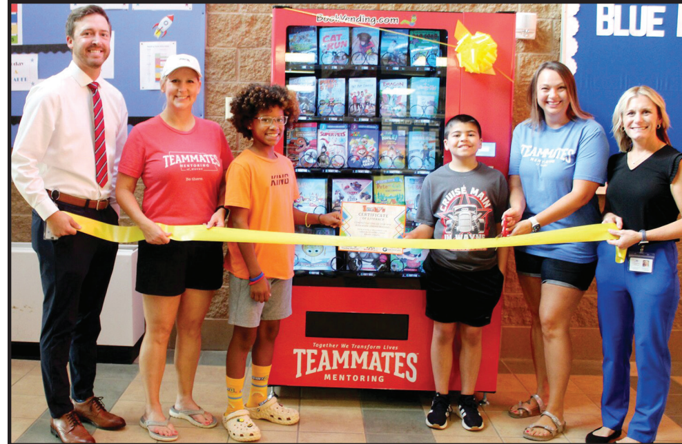
The TeamMates National Office has partnered with READ Nebraska to provide grant funding and materials to elementary TeamMates chapters. Students earn tokens to be used at the book vending machine. 300 books were provided by TeamMates to fill the unique vending machine.

If your home address and/or phone number has changed, please contact the school and give them your new information. Thank you!