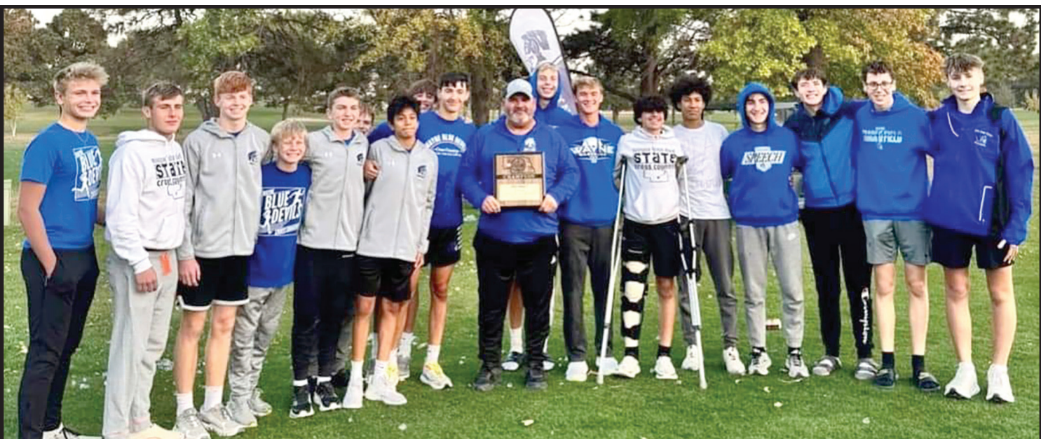
The Wayne Boys' Cross-Country Team just raced their way to victory and are officially the Mid-States Conference & District CHAMPIONS! Congratulations to the whole team and coaches for an unforgettable season!