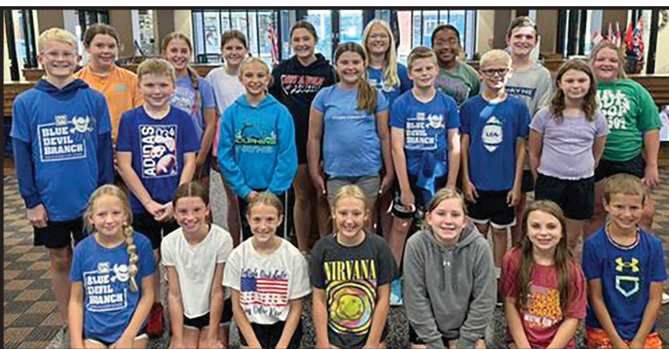
24 fifth and sixth grade students attended training at State Nebraska Bank for the Blue Devil Branch at the Elementary. The students will be working as bank tellers to help other students open savings accounts and with weekly deposits. State Nebraska Bank Blue Devil Branch is at the Elementary every Thursday morning before school.