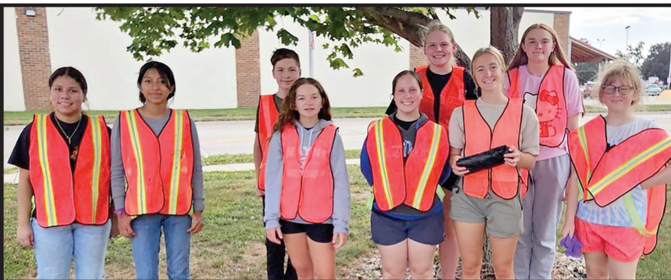
Annual Clean-Up Day! A roadside in Wayne is free of trash thanks to FCCLA club members!