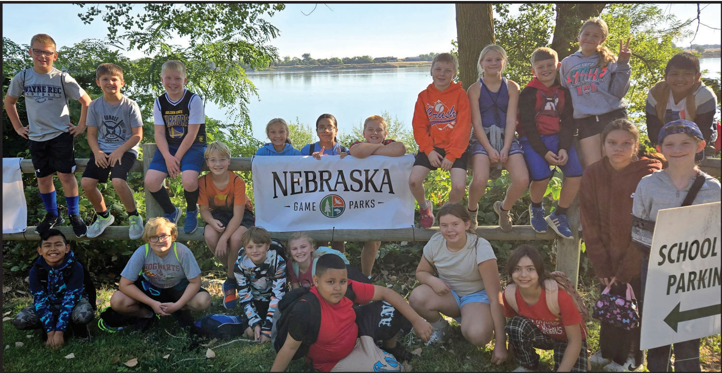
5th Grade enjoyed their trip to the Missouri River Outdoor Expo in Ponca.