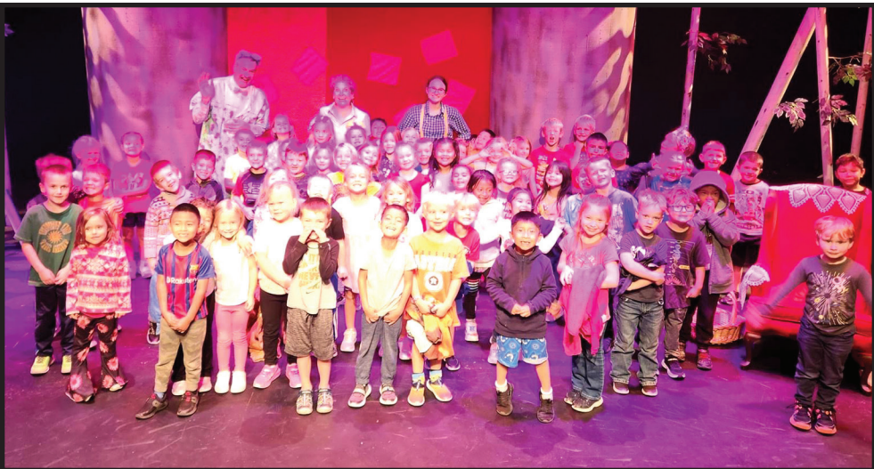
Our kindergarteners recently took a fun-filled field trip to The Little Red Hen Theater to watch Little Red Riding Hood! For some, it was also their first ride on a school bus! So many smiles and laughs all around!