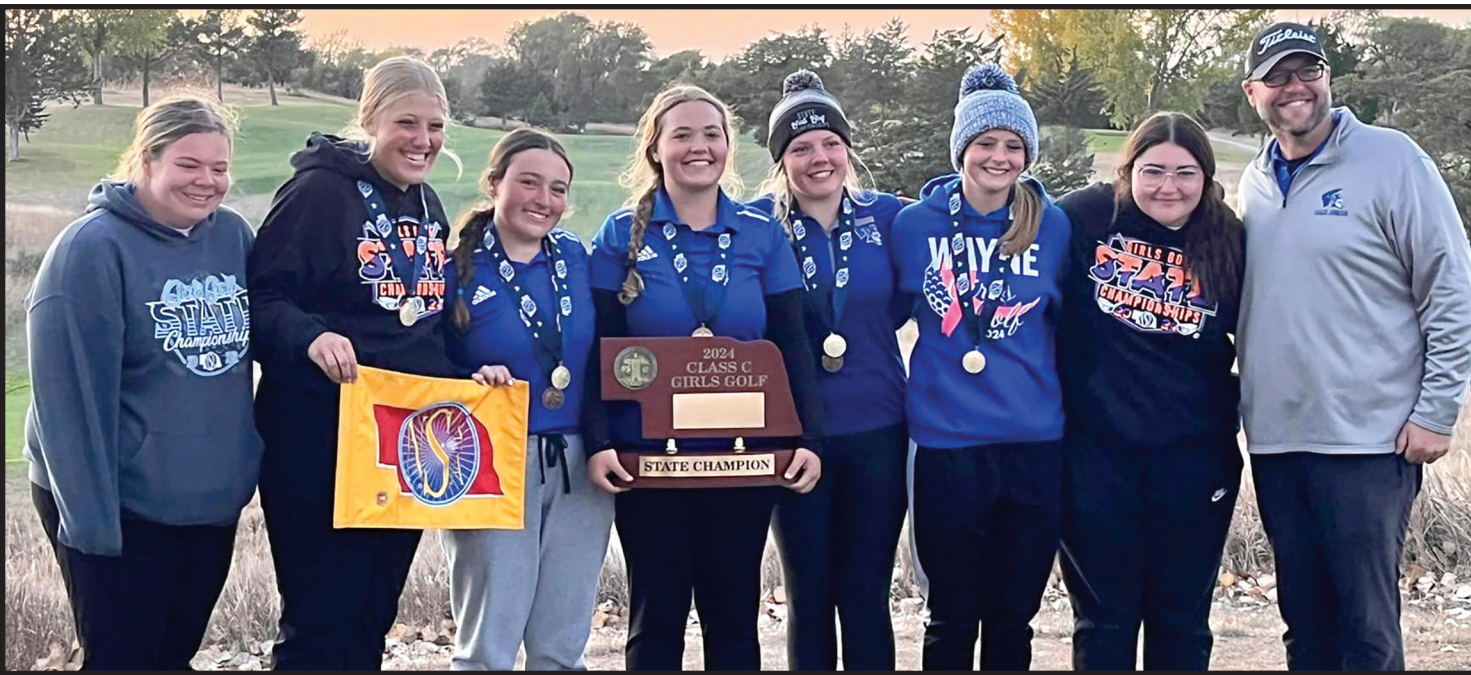
CONGRATULATIONS to the Wayne High Girls golf team for winning the Class C State Tournament! The girls were also Class C3 District Champs! Way to go ladies!!